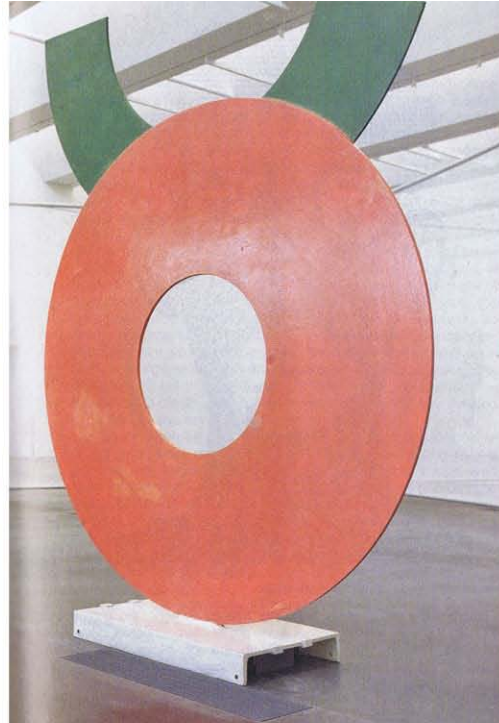
"David Smith: Cubes and Anarchy" Installation View, Los Angeles County Museum of Art, 2011