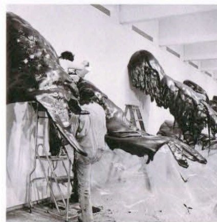
This spread, Benglis making Adhesive Products at the Walker.

work that followed was anything but polite. These new pieces, polyurethane shapes formed on armatures, jutted aggressively from the wall, erupting into the observer's space.