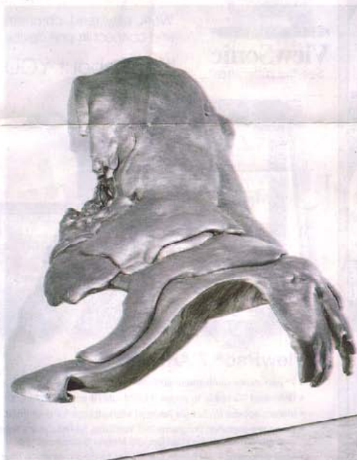
CHIAM & READ, DACS, LONDON/VAGA

More images of the artist's work: nytimes.com/design