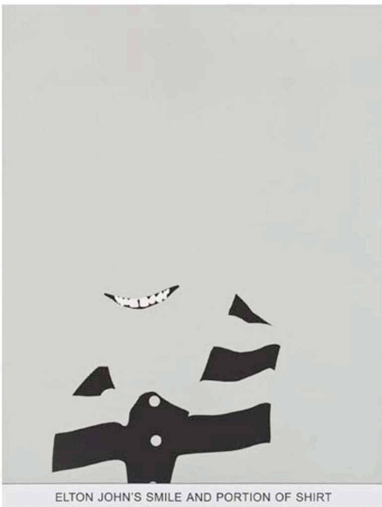
ELTON JOHN'S SMILE AND PORTION OF SHIRT

On gray grounds appear black or white silhouettes of objects and bodies. But unlike flashcards, which idealize objects by turning them into icons so that they can be easily identified, Baldessari's home-brewed flashcards are based on the way things actually look in the world, where they are seen from odd angles, are partially blocked by other objects or are shrouded in shadows.