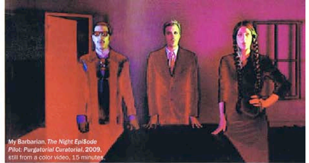
My Barbarian, The Night Episode Pilot: Purgatorial Curatorial , 2009, still from a color video, 15 minutes.