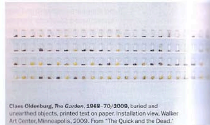
Claes Oldenburg, The Garden , 1968-70/2009, buried and unearthed objects, printed text on paper. Installation view, Walker Art Center, Minneapolis, 2009. From "The Quick and the Dead."