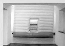
THIS PAGE AND OPPOSITE: MUNGO THOMSON, Skyspace Bouncehouse , 2007. CUSTOM-MADE, INFLATABLE, VINYL BOUNCE HOUSE AND ELECTRIC AIR BLOWER. 15 X 16 X 16 FEET. EDITION OF 2.